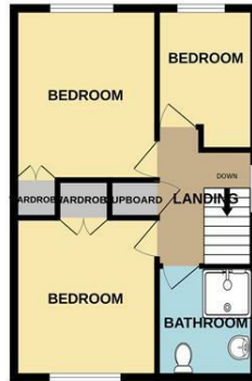
1ST FLOOR 429 sq ft. (39.9 sq.m.) approx.